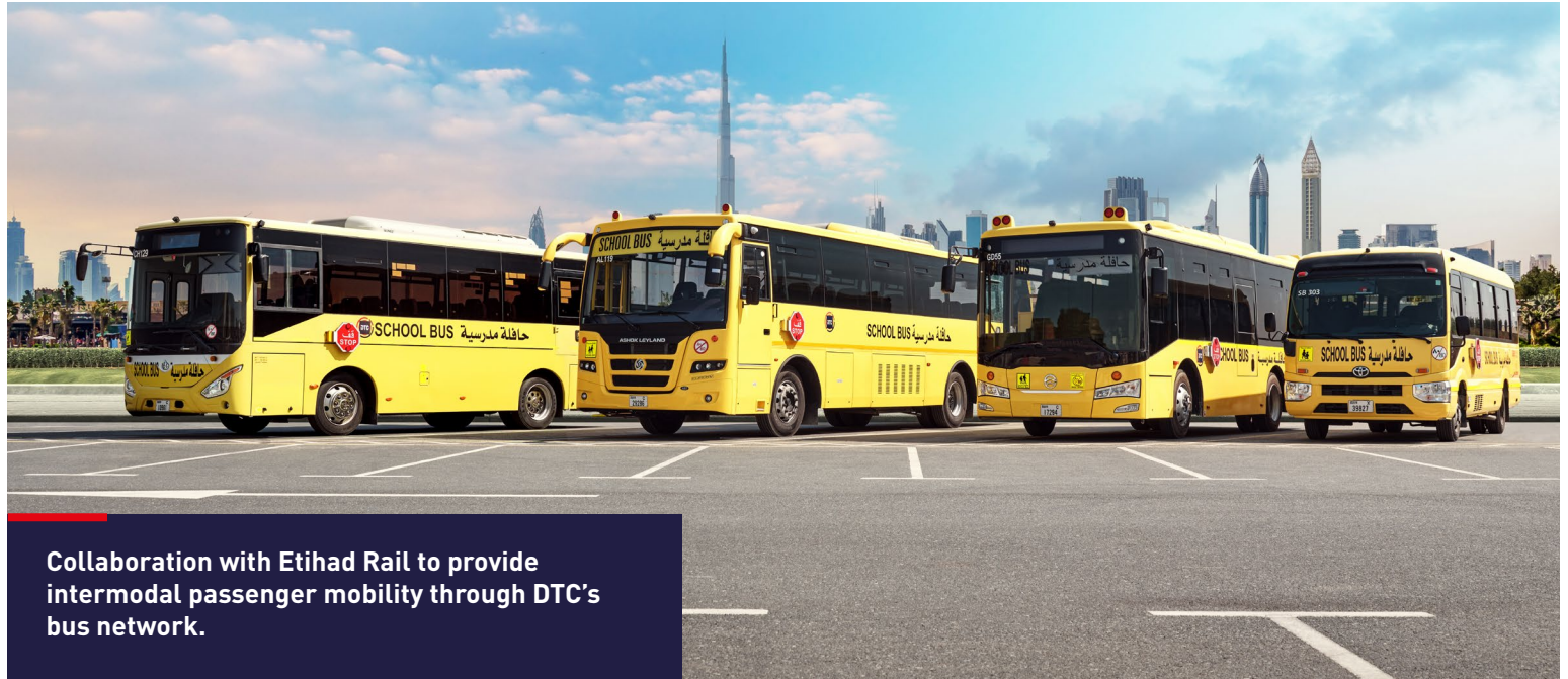
Fleet size (as of 31 December)

Technology remained central to performance improvements, with DTC's smart systems enabling real-time route tracking, safety monitoring, and predictive maintenance. The DTC School Bus App allowed parents to monitor journeys in real time and receive notifications on arrivals and route changes, reinforcing transparency and safety.